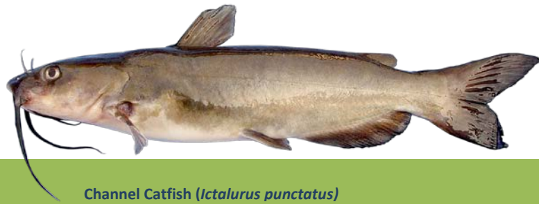
Channel Catfish ( Ictalurus punctatus )